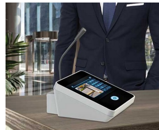
Table microphone / inter phone