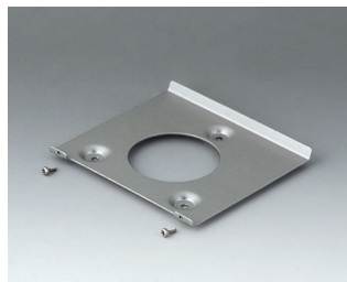
B4518101 Wall suspension element 180 Aluminum