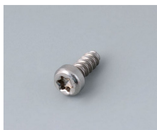
A0325060 Self-tapping screw 0.098" x 0.236" (T8) Stainless steel