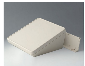
B4422207 PROTEC 220, Vers. II ASA+PC (UL 94 V-0) off-white RAL 9002 8.66"x8.66"x4.25" IP 65 opt.