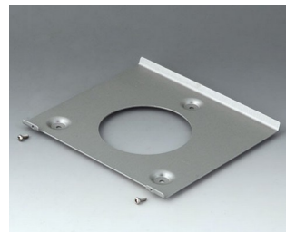
B4522101 Wall suspension element 220 Aluminum