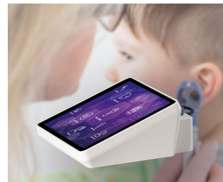
Hearing test device