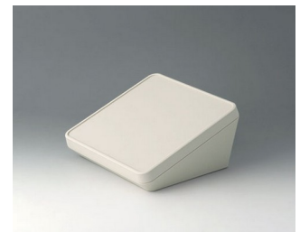
B4418107 PROTEC 180, Vers. I ASA+PC (UL 94 V-0) off-white RAL 9002 7.09"x7.09"x3.62" IP 65 opt.