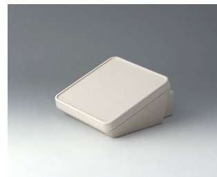
B4414307 PROTEC 140, Vers. III ASA+PC (UL 94 V-0) off-white RAL 9002 5.51"x6.30"x2.99" IP 65 opt.