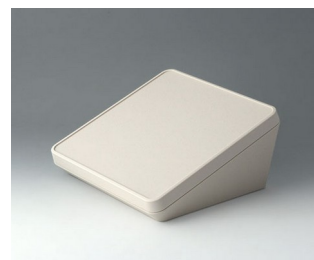
B4422107 PROTEC 220, Vers. I ASA+PC (UL 94 V-0) off-white RAL 9002 8.66"x8.66"x4.25" IP 65 opt.