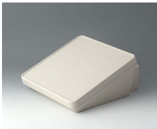
B4422307 PROTEC 220, Vers. III ASA+PC (UL 94 V-0) off-white RAL 9002 8.66"x9.57"x4.25" IP 65 opt.