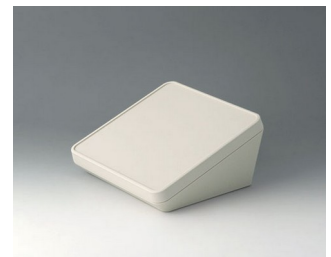
B4418107 PROTEC 180, Vers. I ASA+PC (UL 94 V-0) off-white RAL 9002 7.09"x7.09"x3.62" IP 65 opt.