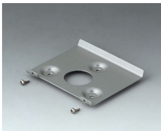
B4514101 Wall suspension element 140 Aluminum