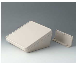
B4418207 PROTEC 180, Vers. II ASA+PC (UL 94 V-0) off-white RAL 9002 7.09"x7.09"x3.62" IP 65 opt.