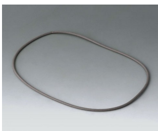
B4514030 Sealing 140