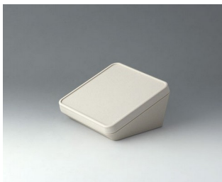
B4414107 PROTEC 140, Vers. I ASA+PC (UL 94 V-0) off-white RAL 9002 5.51"x5.51"x2.99" IP 65 opt.