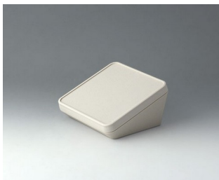
B4414107 PROTEC 140, Vers. I ASA+PC (UL 94 V-0) off-white RAL 9002 5.51"x5.51"x2.99" IP 65 opt.