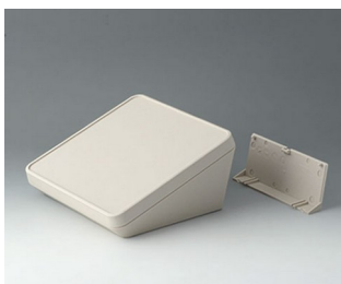
B4418207 PROTEC 180, Vers. II ASA+PC (UL 94 V-0) off-white RAL 9002 7.09"x7.09"x3.62" IP 65 opt.