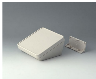
B4414207 PROTEC 140, Vers. II ASA+PC (UL 94 V-0) off-white RAL 9002 5.51"x5.51"x2.99" IP 65 opt.