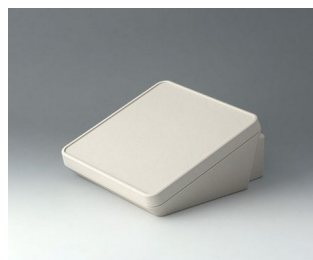
B4418307 PROTEC 180, Vers. III ASA+PC (UL 94 V-0) off-white RAL 9002 7.09"x7.91"x3.62" IP 65 opt.