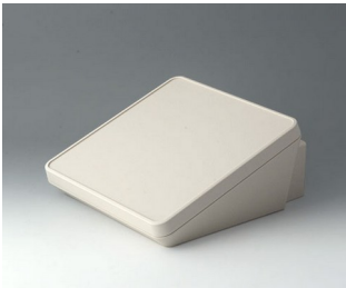
B4422307 PROTEC 220, Vers. III ASA+PC (UL 94 V-0) off-white RAL 9002 8.66"x9.57"x4.25" IP 65 opt.