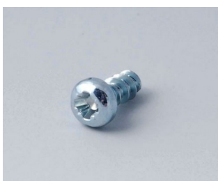
A0305031 Self-tapping screws 0.098" x 0.236" (PZ1)