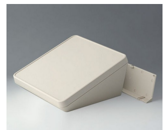
B4422207 PROTEC 220, Vers. II ASA+PC (UL 94 V-0) off-white RAL 9002 8.66"x8.66"x4.25" IP 65 opt.