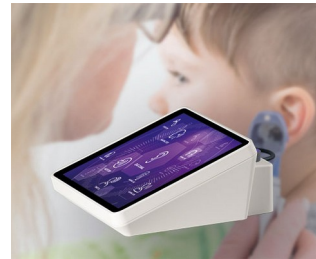
Hearing test device