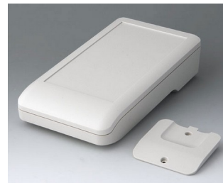
A9007217 DATEC-COMPACT L ASA+PC (UL 94 V-0) off-white RAL 9002 8.11"x4.33"x1.85" IP 41