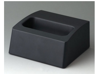
A9106508 Station M ASA+PC (UL 94 V-0) lava