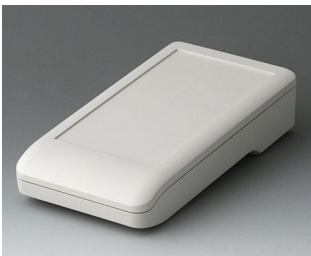
A9006107 DATEC-COMPACT M ASA+PC (UL 94 V-0) off-white RAL 9002 6.77"x3.62"x1.54" IP 65