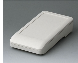
A9005117 DATEC-COMPACT S ASA+PC (UL 94 V-0) off-white RAL 9002 5.35"x2.91"x1.26" IP 41