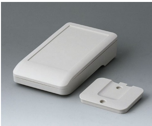
A9005207 DATEC-COMPACT S ASA+PC (UL 94 V-0) off-white RAL 9002 5.35"x2.91"x1.26" IP 65