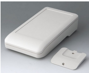
A9007207 DATEC-COMPACT L ASA+PC (UL 94 V-0) off-white RAL 9002 8.11"x4.33"x1.85" IP 65