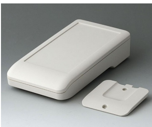
A9006207 DATEC-COMPACT M ASA+PC (UL 94 V-0) off-white RAL 9002 6.77"x3.62"x1.54" IP 65