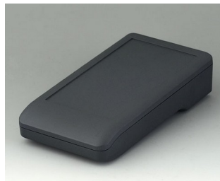
A9006108 DATEC-COMPACT M ASA+PC (UL 94 V-0) lava 6.77"x3.62"x1.54" IP 65