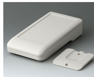
A9006217 DATEC-COMPACT M ASA+PC (UL 94 V-0) off-white RAL 9002 6.77"x3.62"x1.54" IP 41