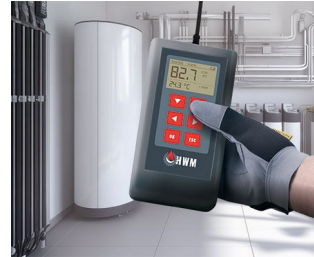
Measuring device for heating water