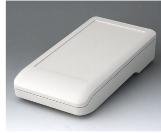
A9007117 DATEC-COMPACT L ASA+PC (UL 94 V-0) off-white RAL 9002 8.11"x4.33"x1.85" IP 41