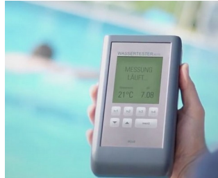
Electronic pool tester