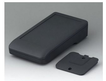
A9006218 DATEC-COMPACT M ASA+PC (UL 94 V-0) lava 6.77"x3.62"x1.54" IP 41