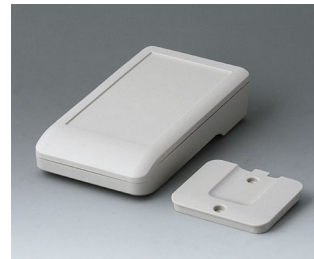
A9005217 DATEC-COMPACT S ASA+PC (UL 94 V-0) off-white RAL 9002 5.35"x2.91"x1.26" IP 41