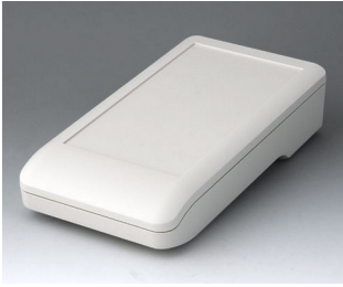
A9007107 DATEC-COMPACT L ASA+PC (UL 94 V-0) off-white RAL 9002 8.11"x4.33"x1.85" IP 65