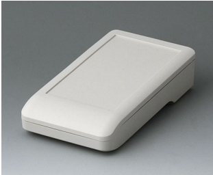
A9005107 DATEC-COMPACT S ASA+PC (UL 94 V-0) off-white RAL 9002 5.35"x2.91"x1.26" IP 65