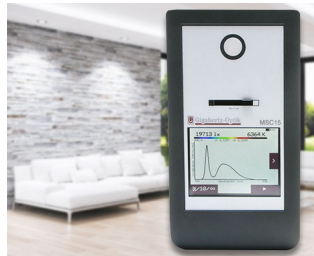
Spectral light meter