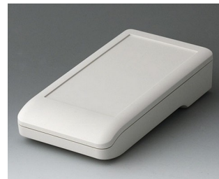
A9006117 DATEC-COMPACT M ASA+PC (UL 94 V-0) off-white RAL 9002 6.77"x3.62"x1.54" IP 41