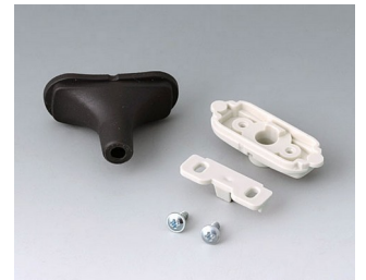
B2911329 Cable gland kit, 0.197" - 0.232" TPE black RAL 9005