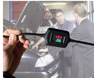
Voltage and current display during trickle charging