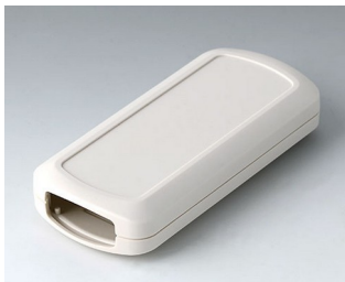
B2833107 CONNECT M ASA+PC (UL 94 V-0) off-white RAL 9002 4.57"x2.13"x0.87"