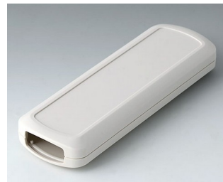
B2834107 CONNECT M ASA+PC (UL 94 V-0) off-white RAL 9002 6.14"x2.13"x0.87"