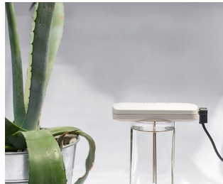
Tool for making colloidal silver solutions