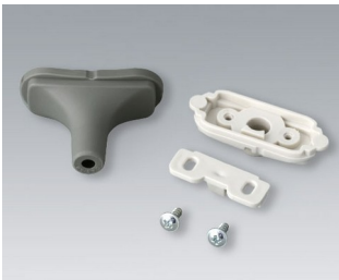
B2911318 Cable gland kit, 0.165" - 0.197" TPE volcano