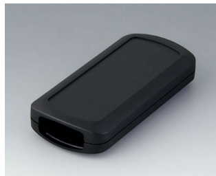
B2833109 CONNECT M ASA+PC (UL 94 V-0) black RAL 9005 4.57"x2.13"x0.87"