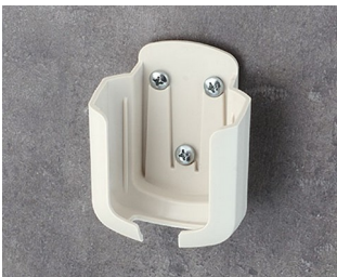
B2931507 Holder M ASA+PC (UL 94 V-0) off-white RAL 9002