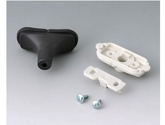
B2911309 Cable gland kit, 0.134" - 0.165" TPE black RAL 9005