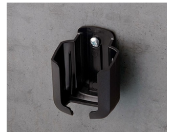
B2921509 Holder S ASA+PC (UL 94 V-0) black RAL 9005