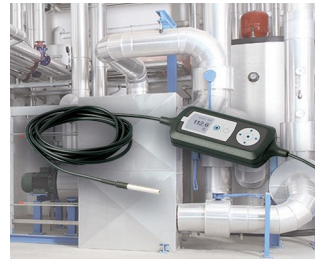
Process monitoring with temperature sensor