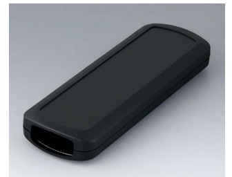
B2834109 CONNECT M ASA+PC (UL 94 V-0) black RAL 9005 6.14"x2.13"x0.87"