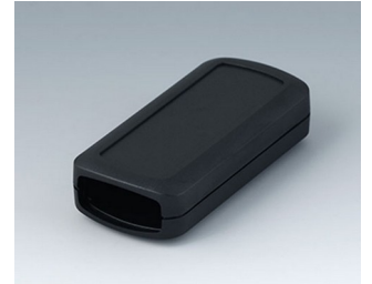
B2823109 CONNECT S ASA+PC (UL 94 V-0) black RAL 9005 3.54"x1.65"x0.87"