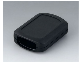
B2832109 CONNECT M ASA+PC (UL 94 V-0) black RAL 9005 2.99"x2.13"x0.87"