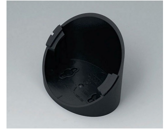
B5011319 Base 55° ABS (UL 94 HB) black RAL 9005