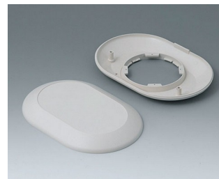
B5015007 Bottom and top part O160 F ABS (UL 94 HB) off-white RAL 9002 6.30"x4.33"x1.18"