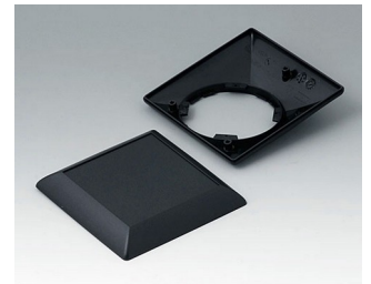
B5012209 Bottom and top part S110F ABS (UL 94 HB) black RAL 9005 4.33"x4.33"x1.50"