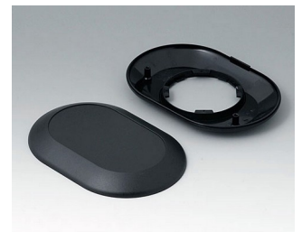
B5015009 Bottom and top part O160 F ABS (UL 94 HB) black RAL 9005 6.30"x4.33"x1.18"