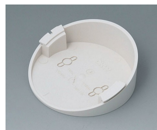
B5011217 Base 30° ABS (UL 94 HB) off-white RAL 9002