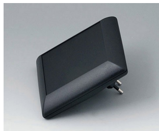
B5013229 ART-CASE S110 F PC+ABS (UL 94 V-0) black RAL 9005 4.33"x4.33"x1.50" IP 40