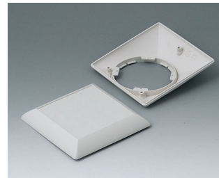
B5012207 Bottom and top part S110F ABS (UL 94 HB) off-white RAL 9002 4.33"x4.33"x1.50"