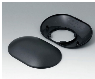
B5015309 Bottom and top part O160 H ABS (UL 94 HB) black RAL 9005 6.30"x4.33"x1.61"