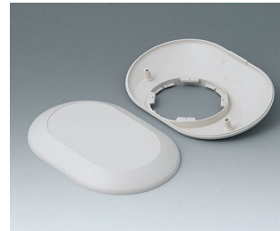
B5015207 Bottom and top part O160 F ABS (UL 94 HB) off-white RAL 9002 6.30"x4.33"x1.50"