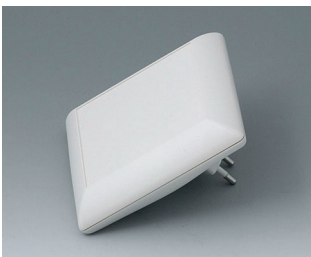
B5013227 ART-CASE S110 F PC+ABS (UL 94 V-0) off-white RAL 9002 4.33"x4.33"x1.50" IP 40