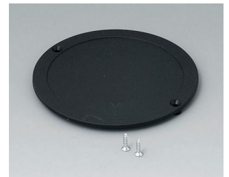
B5011849 Lid ABS (UL 94 HB) black RAL 9005