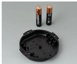
B5111109 Battery compartment, 2 x AAA ABS (UL 94 HB) black RAL 9005