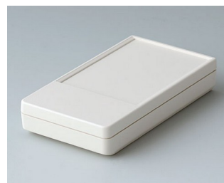
A9070117 DATEC-POCKET-BOX S ABS (UL 94 HB) off-white RAL 9002 3.35"x1.81"x0.63" IP 54