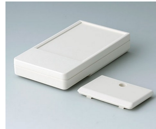
A9071107 DATEC-POCKET-BOX M ABS (UL 94 HB) off-white RAL 9002 4.13"x2.28"x0.73" IP 41