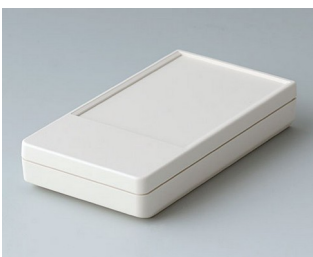
A9070107 DATEC-POCKET-BOX S ABS (UL 94 HB) off-white RAL 9002 3.35"x1.81"x0.63" IP 41