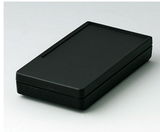
A9070219 DATEC-POCKET-BOX S PMMA (IR) (UL 94 HB) black RAL 9005 3.35"x1.81"x0.63" IP 54