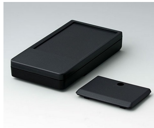
A9072109 DATEC-POCKET-BOX L ABS (UL 94 HB) black RAL 9005 4.72"x2.56"x0.87" IP 41