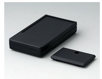
A9071219 DATEC-POCKET-BOX M PMMA (IR) (UL 94 HB) black RAL 9005 4.13"x2.28"x0.73" IP 54