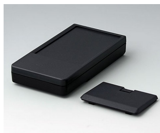
A9072129 DATEC-POCKET-BOX L ABS (UL 94 HB) black RAL 9005 4.72"x2.56"x0.87" IP 41