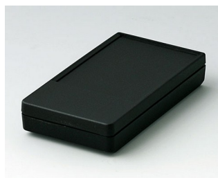
A9070109 DATEC-POCKET-BOX S ABS (UL 94 HB) black RAL 9005 3.35"x1.81"x0.63" IP 41