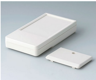
A9072107 DATEC-POCKET-BOX L ABS (UL 94 HB) off-white RAL 9002 4.72"x2.56"x0.87" IP 41