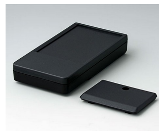
A9072209 DATEC-POCKET-BOX L PMMA (IR) (UL 94 HB) black RAL 9005 4.72"x2.56"x0.87" IP 41