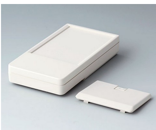
A9072127 DATEC-POCKET-BOX L ABS (UL 94 HB) off-white RAL 9002 4.72"x2.56"x0.87" IP 41