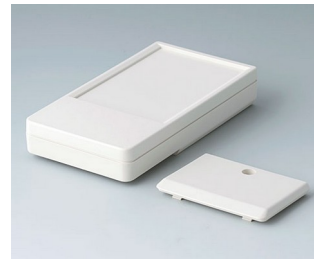
A9072117 DATEC-POCKET-BOX L ABS (UL 94 HB) off-white RAL 9002 4.72"x2.56"x0.87" IP 54