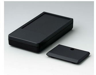
A9072119 DATEC-POCKET-BOX L ABS (UL 94 HB) black RAL 9005 4.72"x2.56"x0.87" IP 54