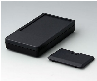
A9072229 DATEC-POCKET-BOX L PMMA (IR) (UL 94 HB) black RAL 9005 4.72"x2.56"x0.87" IP 41