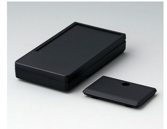
A9071109 DATEC-POCKET-BOX M ABS (UL 94 HB) black RAL 9005 4.13"x2.28"x0.73" IP 41