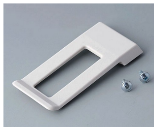
A9172107 Belt/Pocket clip ABS (UL 94 HB) off-white RAL 9002 2.44"x1.18"