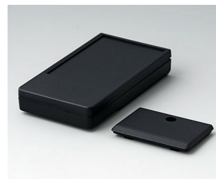
A9071209 DATEC-POCKET-BOX M PMMA (IR) (UL 94 HB) black RAL 9005 4.13"x2.28"x0.73" IP 41