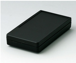
A9070209 DATEC-POCKET-BOX S PMMA (IR) (UL 94 HB) black RAL 9005 3.35"x1.81"x0.63" IP 41