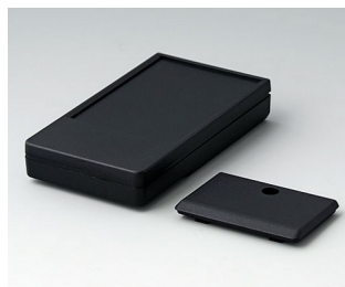
A9071119 DATEC-POCKET-BOX M ABS (UL 94 HB) black RAL 9005 4.13"x2.28"x0.73" IP 54