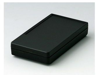
A9070119 DATEC-POCKET-BOX S ABS (UL 94 HB) black RAL 9005 3.35"x1.81"x0.63" IP 54