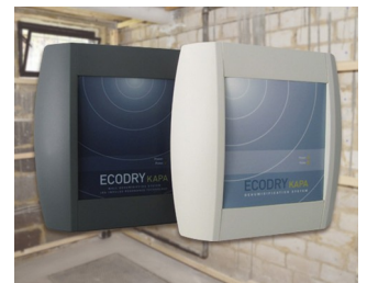
Systems for drying brickwork