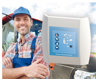
Weather Monitoring Station