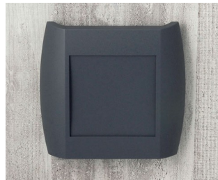
A9092108 DIATEC XS ABS (UL 94 HB) lava 5.91"x1.46"x6.10" IP 40