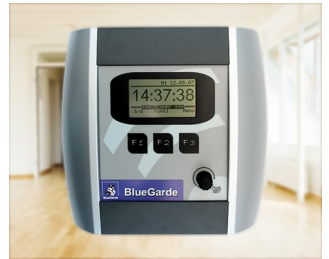
House control unit