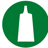
Installation / Assembly of accessories