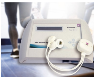
WBA receiver unit for measuring biosignals