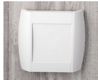
A9093107 DIATEC S ABS (UL 94 HB) off-white RAL 9002 8.27"x1.89"x7.87" IP 40