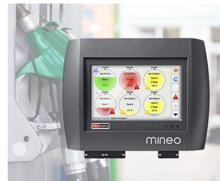
Controller for intelligent tank management