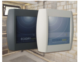
Systems for drying brickwork