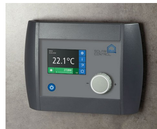
Solar Control Panel