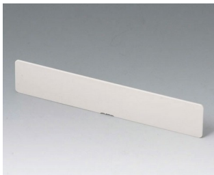
A9194007 Slot-in panel ABS (UL 94 HB) off-white RAL 9002 6.14"x1.18"x0.12"