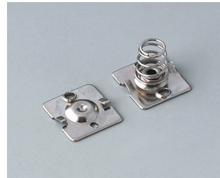
A9190015 Set of battery clips, 2 x AA Steel nickel-plated