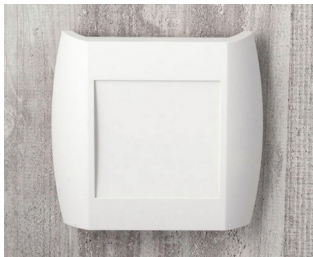
A9092107 DIATEC XS ABS (UL 94 HB) off-white RAL 9002 5.91"x1.46"x6.10" IP 40