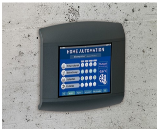
Control panel for home automation