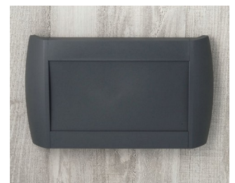
A9095108 DIATEC L ABS (UL 94 HB) lava 12.99"x1.89"x7.87" IP 40