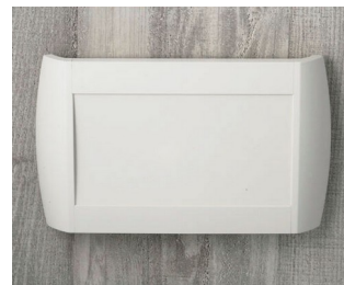
A9095107 DIATEC L ABS (UL 94 HB) off-white RAL 9002 12.99"x1.89"x7.87" IP 40