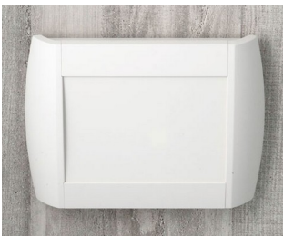
A9094107 DIATEC M ABS (UL 94 HB) off-white RAL 9002 10.63"x1.89"x7.87" IP 40