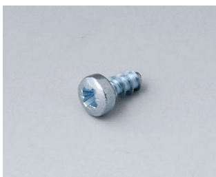
A0306031 Self-tapping screws 0.118" x 0.236" (PZ1)