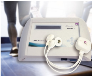
WBA receiver unit for measuring biosignals