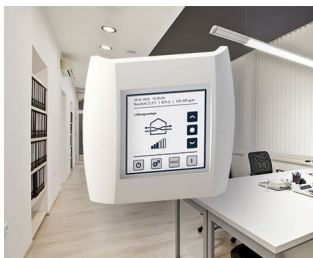
Indoor air quality control