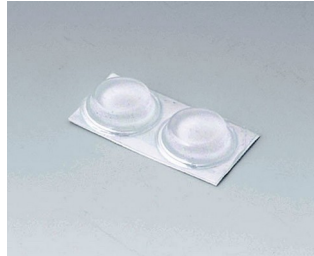
A9212330 Anti-slide feet 0.472" x 0.138" transparent

Subject to technical modification without notice. © by OKW Gehäusesysteme, Buchen/Germany.