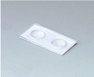
A9207150 Anti-slide feet 0.256" x 0.079" transparent