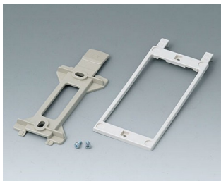
B1360048 Wall suspension elements ABS (UL 94 HB) pebble gray RAL 7032