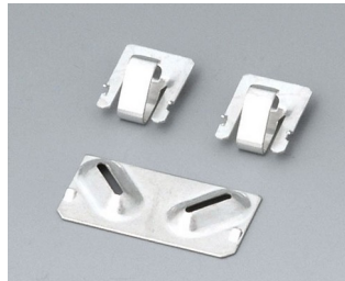
A9190002 Set of battery clips, 2xN/2xAA/2xAAA Steel tin-plated