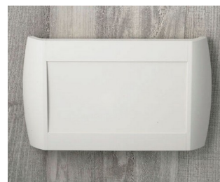
A9095107 DIATEC L ABS (UL 94 HB) off-white RAL 9002 12.99"x1.89"x7.87" IP 40