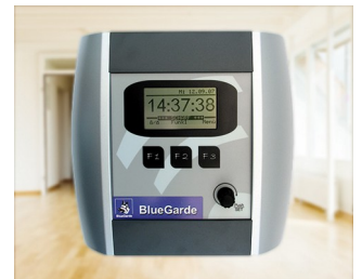
House control unit