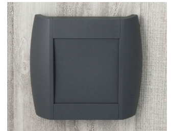
A9093108 DIATEC S ABS (UL 94 HB) lava 8.27"x1.89"x7.87" IP 40