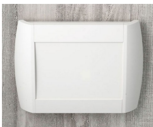
A9094107 DIATEC M ABS (UL 94 HB) off-white RAL 9002 10.63"x1.89"x7.87" IP 40