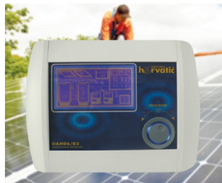
Control unit for photovoltaic solar installations