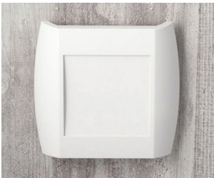
A9092107 DIATEC XS ABS (UL 94 HB) off-white RAL 9002 5.91"x1.46"x6.10" IP 40