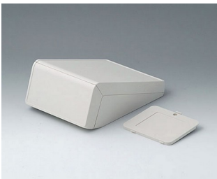
B4054307 UNITEC S, 0.02/0.02 ABS (UL 94 HB) off-white RAL 9002 4.92"x6.97"x2.72" IP 40