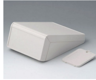
B4056227 UNITEC M, 0.06/0.02 ABS (UL 94 HB) off-white RAL 9002 5.83"x8.27"x3.15" IP 40