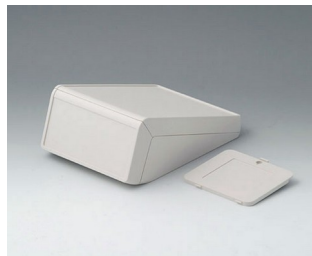
B4054317 UNITEC S, 0.06/0.06 ABS (UL 94 HB) off-white RAL 9002 4.92"x6.97"x2.72" IP 40