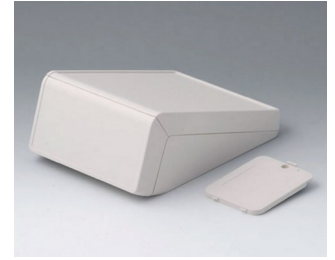
B4056237 UNITEC M, 0.02/0.06 ABS (UL 94 HB) off-white RAL 9002 5.83"x8.27"x3.15" IP 40