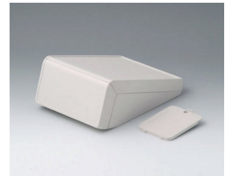
B4054237 UNITEC S, 0.02/0.06 ABS (UL 94 HB) off-white RAL 9002 4.92"x6.97"x2.72" IP 40