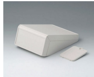
B4054227 UNITEC S, 0.06/0.02 ABS (UL 94 HB) off-white RAL 9002 4.92"x6.97"x2.72" IP 40