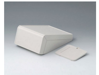
B4054337 UNITEC S, 0.02/0.06 ABS (UL 94 HB) off-white RAL 9002 4.92"x6.97"x2.72" IP 40