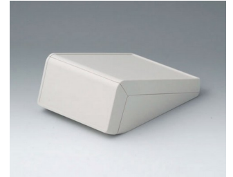
B4054137 UNITEC S, 0.02/0.06 ABS (UL 94 HB) off-white RAL 9002 4.92"x6.97"x2.72" IP 40