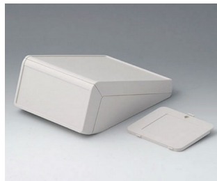
B4056317 UNITEC M, 0.06/0.06 ABS (UL 94 HB) off-white RAL 9002 5.83"x8.27"x3.15" IP 40