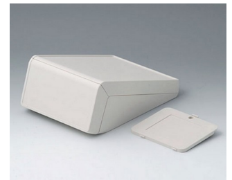
B4056337 UNITEC M, 0.02/0.06 ABS (UL 94 HB) off-white RAL 9002 5.83"x8.27"x3.15" IP 40