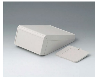
B4054327 UNITEC S, 0.06/0.02 ABS (UL 94 HB) off-white RAL 9002 4.92"x6.97"x2.72" IP 40