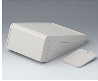
B4056217 UNITEC M, 0.06/0.06 ABS (UL 94 HB) off-white RAL 9002 5.83"x8.27"x3.15" IP 40