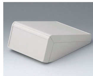
B4056127 UNITEC M, 0.06/0.02 ABS (UL 94 HB) off-white RAL 9002 5.83"x8.27"x3.15" IP 40