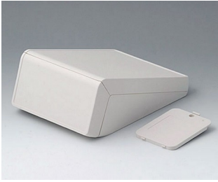
B4056207 UNITEC M, 0.02/0.02 ABS (UL 94 HB) off-white RAL 9002 5.83"x8.27"x3.15" IP 40