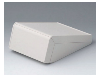
B4056137 UNITEC M, 0.02/0.06 ABS (UL 94 HB) off-white RAL 9002 5.83"x8.27"x3.15" IP 40