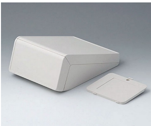
B4056307 UNITEC M, 0.02/0.02 ABS (UL 94 HB) off-white RAL 9002 5.83"x8.27"x3.15" IP 40