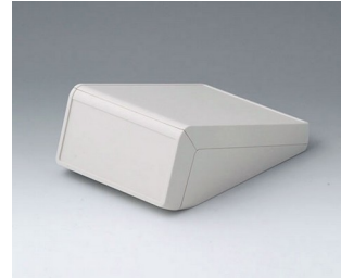
B4054127 UNITEC S, 0.06/0.02 ABS (UL 94 HB) off-white RAL 9002 4.92"x6.97"x2.72" IP 40