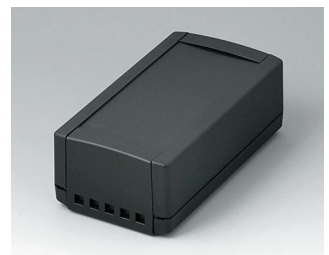
B1060469 TOPTEC 154 H, Vers. II ABS (UL 94 HB) black RAL 9005 6.06"x3.31"x2.20" IP 40