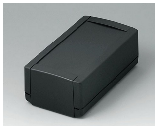
B1060369 TOPTEC 154 H, Vers. I ABS (UL 94 HB) black RAL 9005 6.06"x3.31"x2.20" IP 40