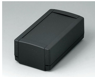
B1050369 TOPTEC 123 H, Vers. I ABS (UL 94 HB) black RAL 9005 4.84"x2.68"x1.77" IP 40