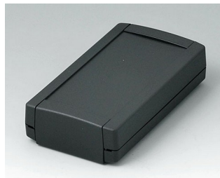
B1055369 TOPTEC 123 F, Vers. I ABS (UL 94 HB) black RAL 9005 4.84"x2.68"x1.18" IP 40