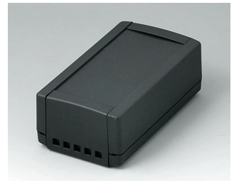
B1050469 TOPTEC 123 H, Vers. II ABS (UL 94 HB) black RAL 9005 4.84"x2.68"x1.77" IP 40