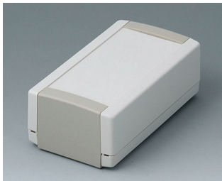
B1050365 TOPTEC 123 H, Vers. I ABS (UL 94 HB) off-white RAL 9002 4.84"x2.68"x1.77" IP 40