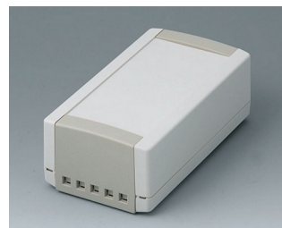
B1060465 TOPTEC 154 H, Vers. II ABS (UL 94 HB) off-white RAL 9002 6.06"x3.31"x2.20" IP 40