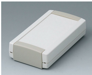
B1055365 TOPTEC 123 F, Vers. I ABS (UL 94 HB) off-white RAL 9002 4.84"x2.68"x1.18" IP 40