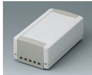
B1050465 TOPTEC 123 H, Vers. II ABS (UL 94 HB) off-white RAL 9002 4.84"x2.68"x1.77" IP 40