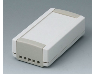
B1040465 TOPTEC 102, Vers. II ABS (UL 94 HB) off-white RAL 9002 4.02"x2.13"x1.18" IP 40