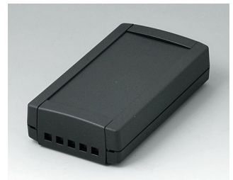
B1055469 TOPTEC 123 F, Vers. II ABS (UL 94 HB) black RAL 9005 4.84"x2.68"x1.18" IP 40