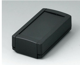
B1040369 TOPTEC 102, Vers. I ABS (UL 94 HB) black RAL 9005 4.02"x2.13"x1.18" IP 40