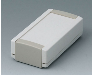
B1040365 TOPTEC 102, Vers. I ABS (UL 94 HB) off-white RAL 9002 4.02"x2.13"x1.18" IP 40