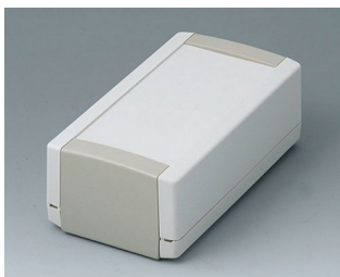
B1060365 TOPTEC 154 H, Vers. I ABS (UL 94 HB) off-white RAL 9002 6.06"x3.31"x2.20" IP 40