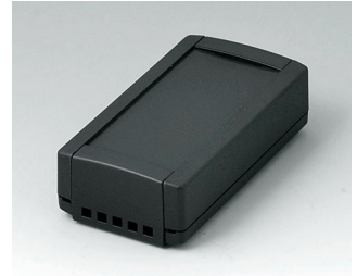
B1040469 TOPTEC 102, Vers. II ABS (UL 94 HB) black RAL 9005 4.02"x2.13"x1.18" IP 40