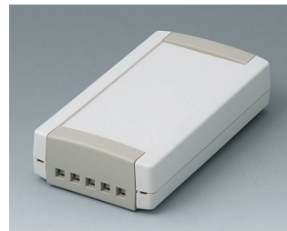
B1055465 TOPTEC 123 F, Vers. II ABS (UL 94 HB) off-white RAL 9002 4.84"x2.68"x1.18" IP 40