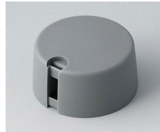
A1031048 TOP-KNOBS 31 PA 6 volcano 31x16mm 4mm