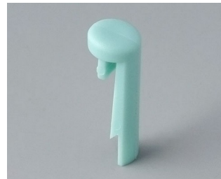
A1101005 Pin PA 6 (UL 94 HB) lagoon