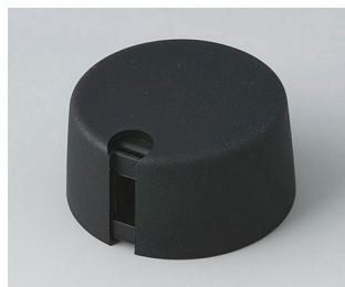
A1031069 TOP-KNOBS 31 PA 6 nero 31x16mm 6mm