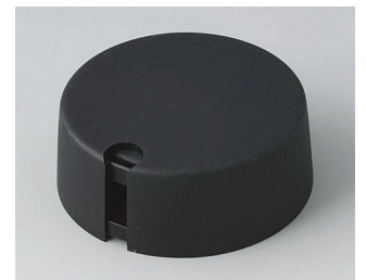
A1040049 TOP-KNOBS 40 PA 6 nero 40x16mm 4mm