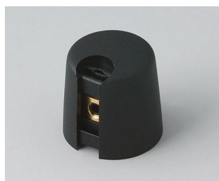
A1016049 TOP-KNOBS 16 PA 6 nero 16x16mm 4mm