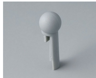
A1102007 Globe PA 6 (UL 94 HB) mineral