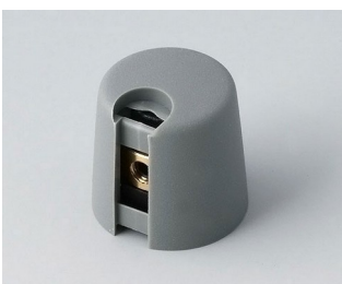
A1016048 TOP-KNOBS 16 PA 6 volcano 16x16mm 4mm