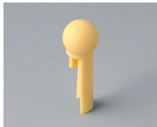
A1102004 Globe PA 6 (UL 94 HB) beach