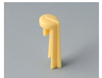
A1105004 Arrow PA 6 (UL 94 HB) beach