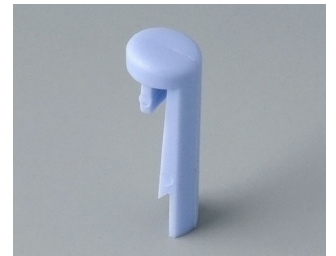
A1101006 Pin PA 6 (UL 94 HB) sky