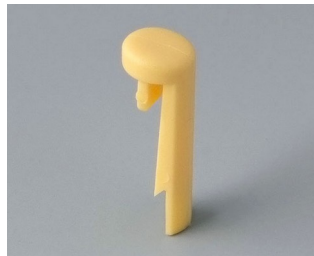
A1101004 Pin PA 6 (UL 94 HB) beach