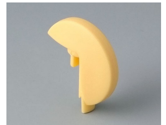
A1103004 Disk PA 6 (UL 94 HB) beach