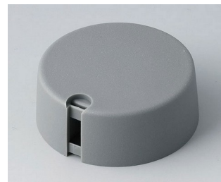
A1040048 TOP-KNOBS 40 PA 6 volcano 40x16mm 4mm