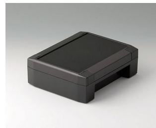
C8014181 SOLID-BOX 145 PC+ABS (UL 94 V-0) anthracite gray RAL 7016 7.09"x5.71"x2.36" IP 66, IP 67, IK 08