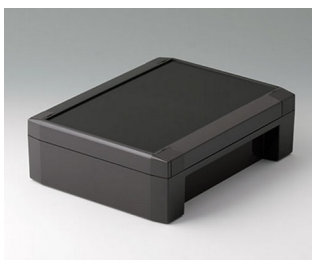
C8017221 SOLID-BOX 175 PC+ABS (UL 94 V-0) anthracite gray RAL 7016 8.86"x6.89"x2.76" IP 66, IP 67, IK 08