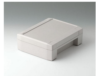
C8014182 SOLID-BOX 145 PC+ABS (UL 94 V-0) light gray RAL 7035 7.09"x5.71"x2.36" IP 66, IP 67, IK 08