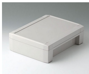
C8017222 SOLID-BOX 175 PC+ABS (UL 94 V-0) light gray RAL 7035 8.86"x6.89"x2.76" IP 66, IP 67, IK 08