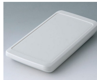
B5403207 SLIM-CASE M, Vers. II ASA+PC (UL 94 V-0) off-white RAL 9002 5.83"x2.91"x0.75" IP 65 opt., IP 40