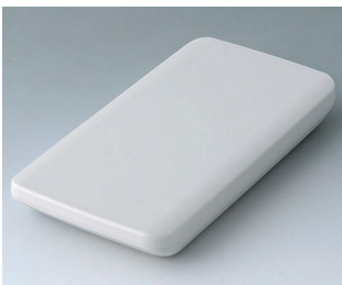
B5403107 SLIM-CASE M, Vers. I ASA+PC (UL 94 V-0) off-white RAL 9002 5.83"x2.91"x0.75" IP 65 opt., IP 40