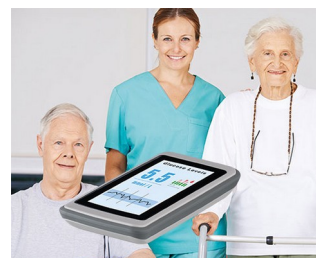
Sensor Checkup System / Monitoring