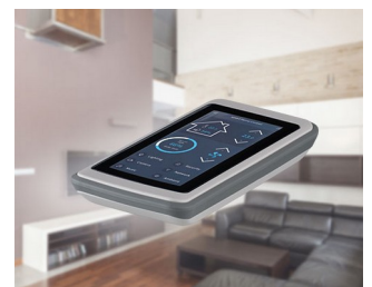
Smart Home Control