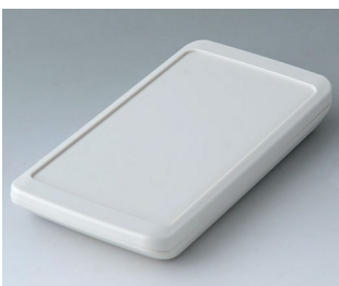
B5403307 SLIM-CASE M, Vers. III ASA+PC (UL 94 V-0) off-white RAL 9002 5.83"x2.91"x0.75" IP 65 opt., IP 40