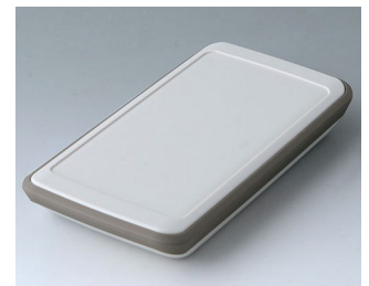
B5403217 SLIM-CASE M, Vers. V ASA+PC (UL 94 V-0) off-white RAL 9002 5.83"x2.91"x0.87" IP 54