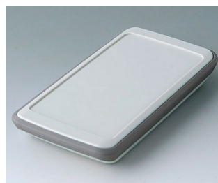
B5403317 SLIM-CASE M, Vers. VI ASA+PC (UL 94 V-0) off-white RAL 9002 5.83"x2.91"x0.87" IP 54