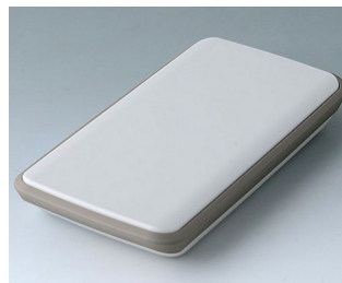
B5403117 SLIM-CASE M, Vers. IV ASA+PC (UL 94 V-0) off-white RAL 9002 5.83"x2.91"x0.87" IP 54