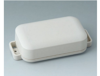
C3206207 EASYTEC 100 ASA+PC (UL 94 V-0) off-white RAL 9002 4.76"x2.44"x1.22" IP 65 opt., IP 40