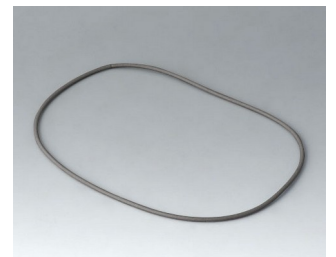
A9504030 Sealing 150