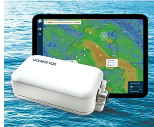
Data Collection for Ocean Observation network