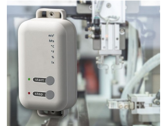
Data logger with gateway function