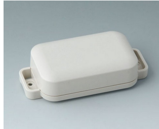
C3204207 EASYTEC 80 ASA+PC (UL 94 V-0) off-white RAL 9002 3.98"x1.97"x1.02" IP 65 opt., IP 40