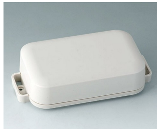
C3207207 EASYTEC 125 ASA+PC (UL 94 V-0) off-white RAL 9002 5.79"x3.07"x1.46" IP 65 opt., IP 40