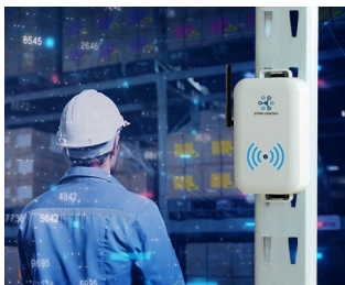
Smart store logistics