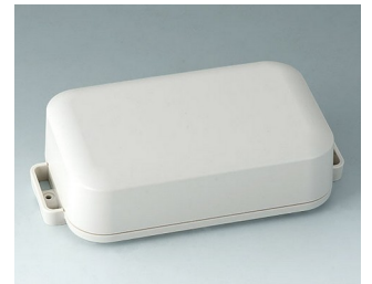
C3208207 EASYTEC 150 ASA+PC (UL 94 V-0) off-white RAL 9002 6.77"x3.66"x1.81" IP 65 opt., IP 40