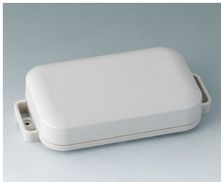
C3207107 EASYTEC 125 ASA+PC (UL 94 V-0) off-white RAL 9002 5.79"x3.07"x1.18" IP 65 opt., IP 40