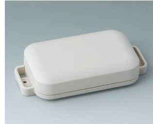
C3206107 EASYTEC 100 ASA+PC (UL 94 V-0) off-white RAL 9002 4.76"x2.44"x1.02" IP 65 opt., IP 40