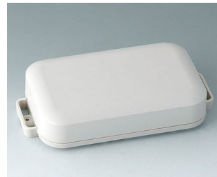
C3208107 EASYTEC 150 ASA+PC (UL 94 V-0) off-white RAL 9002 6.77"x3.66"x1.42" IP 65 opt., IP 40