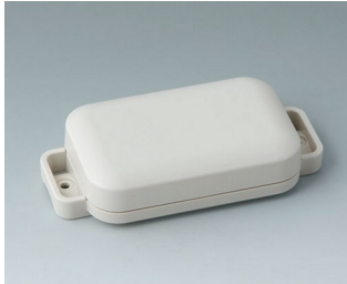
C3204107 EASYTEC 80 ASA+PC (UL 94 V-0) off-white RAL 9002 3.98"x1.97"x0.87" IP 65 opt., IP 40