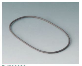
B4708920 Seal S