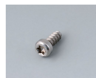
A0325060 Self-tapping screw 0.098" x 0.236" (T8) Stainless steel

Subject to technical modification without notice. © by OKW Gehäusesysteme, Buchen/Germany.