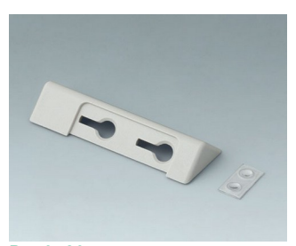
B4705207 Desktop stand set ASA+PC (UL 94 V-0)