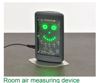
AAL assistance system