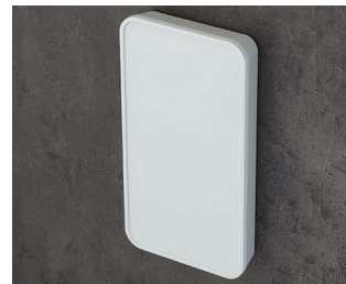
C6406107 SMART-PANEL E155 ASA+PC (UL 94 V-0) traffic white RAL 9016 6.10"x3.31"x0.84" IP 40