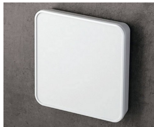
C6404107 SMART-PANEL S114 ASA+PC (UL 94 V-0) traffic white RAL 9016 4.49"x4.49"x0.84" IP 40