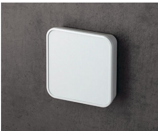
C6402107 SMART-PANEL S84 ASA+PC (UL 94 V-0) traffic white RAL 9016 3.31"x3.31"x0.84" IP 40